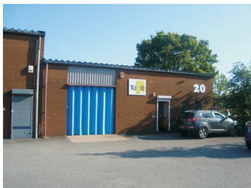
Unit 20 Thorpe Place