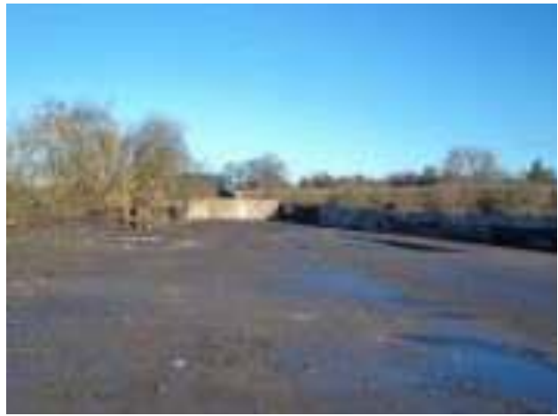
Photographs above of Yard 12