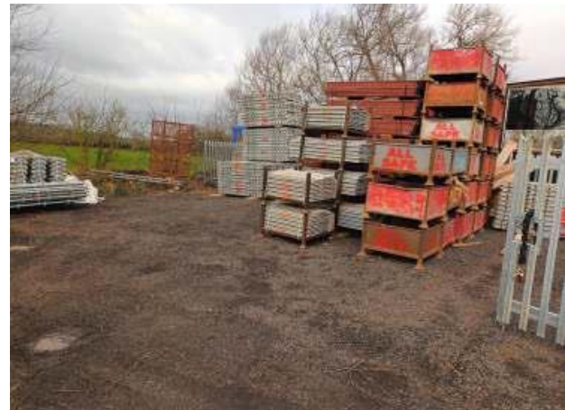
Photographs above of Yard 18

2,000 sq ft | 3,300 sq ft | 15,000 sq ft Fenced Yards New 3 Year Leases. £6,000 | £8,000 | £20,000 per annum