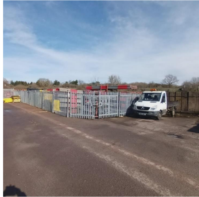
Photographs above of Yard 9